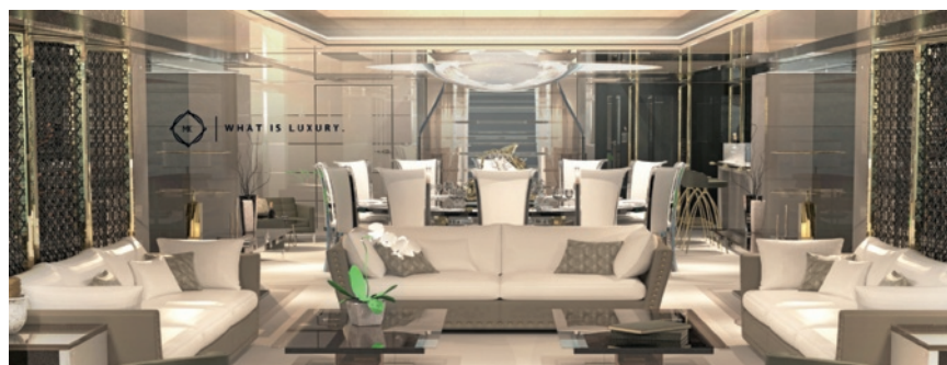
Saloon on the main deck of the yacht Mania, showing the choice of colours and materials made during the design phase.