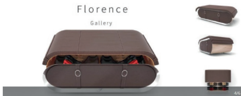
The Florence storage solution.